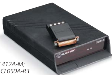
Top: CL412A-M; bottom: CL050A-R3